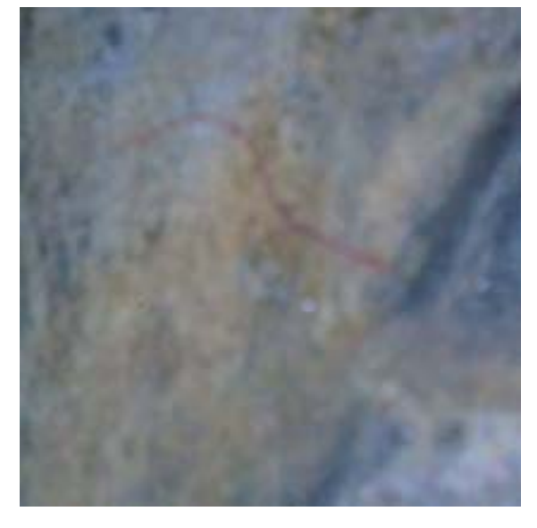
A Juvenile of the Snake of Fire

The Christians make model of reefs, Snakes and eggs with silver and submit it in churches built in the name of St. George with prayers. It is an indirect method for Christians for escaping from the anger of the Snakes of Fire.