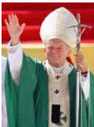
Pope John Paul II

It is noticeable and praiseworthy that His Holiness Pope John Paul II, publicly apologized before Christ for the faults and deviations happened in the past few hundreds of years in the catholic church. The love shown to neighbouring religions by H.H. Pop John Paul II who praised the religious temperament of Muslim community is highly appreciable.